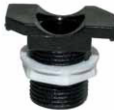
20mm Fluorescent Nylon Adaptor