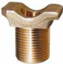
20mm Brass Fluorescent Adaptor