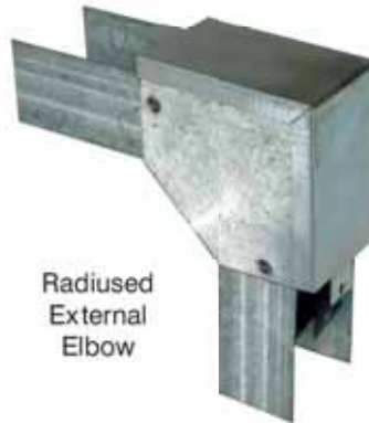
Radiused External Elbow