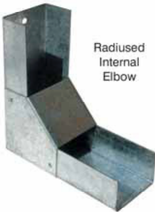
Radiused Internal Elbow