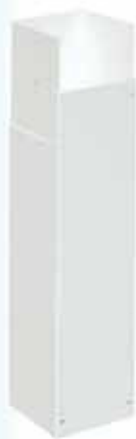
Powerpost 1m extension complete