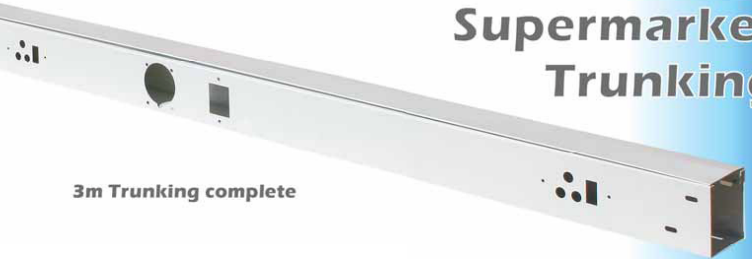
3m Trunking complete