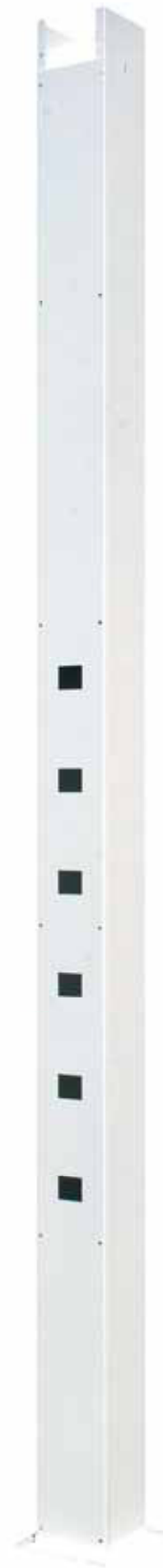
Powerpost 3.5m complete