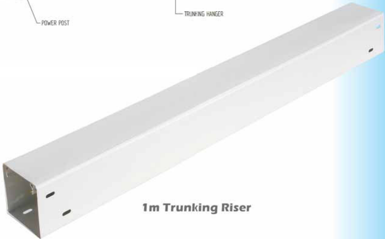
1m Trunking Riser