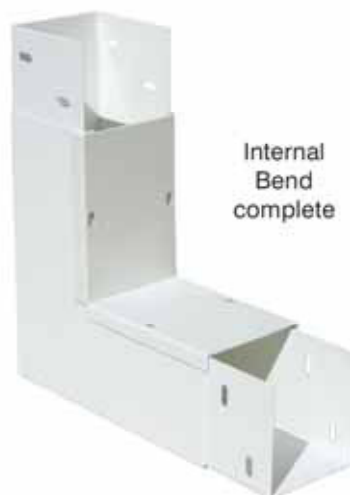
Internal Bend complete