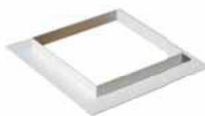
Powerpost Ceiling Flange loose (optional)