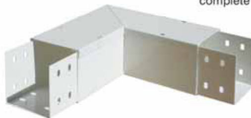
Horizontal Bend complete