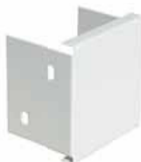
End Cap complete