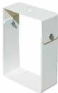
Hanger Bracket complete