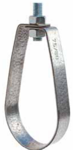
OL75 Series STANDARD FINISH Pre-Galvanized