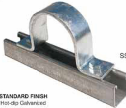
STANDARD FINISH Hot-dip Galvanized