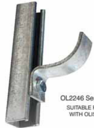
OL2246 Series SUITABLE FOR USE WITH OLISTRUT®